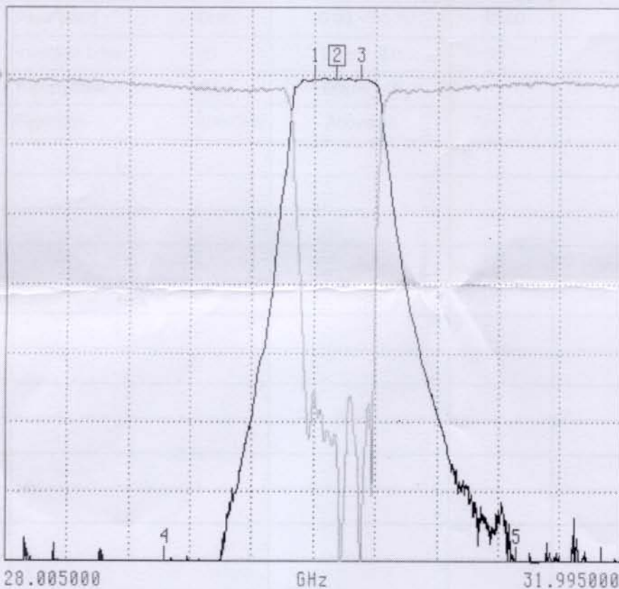
Figure1. S21 & S11