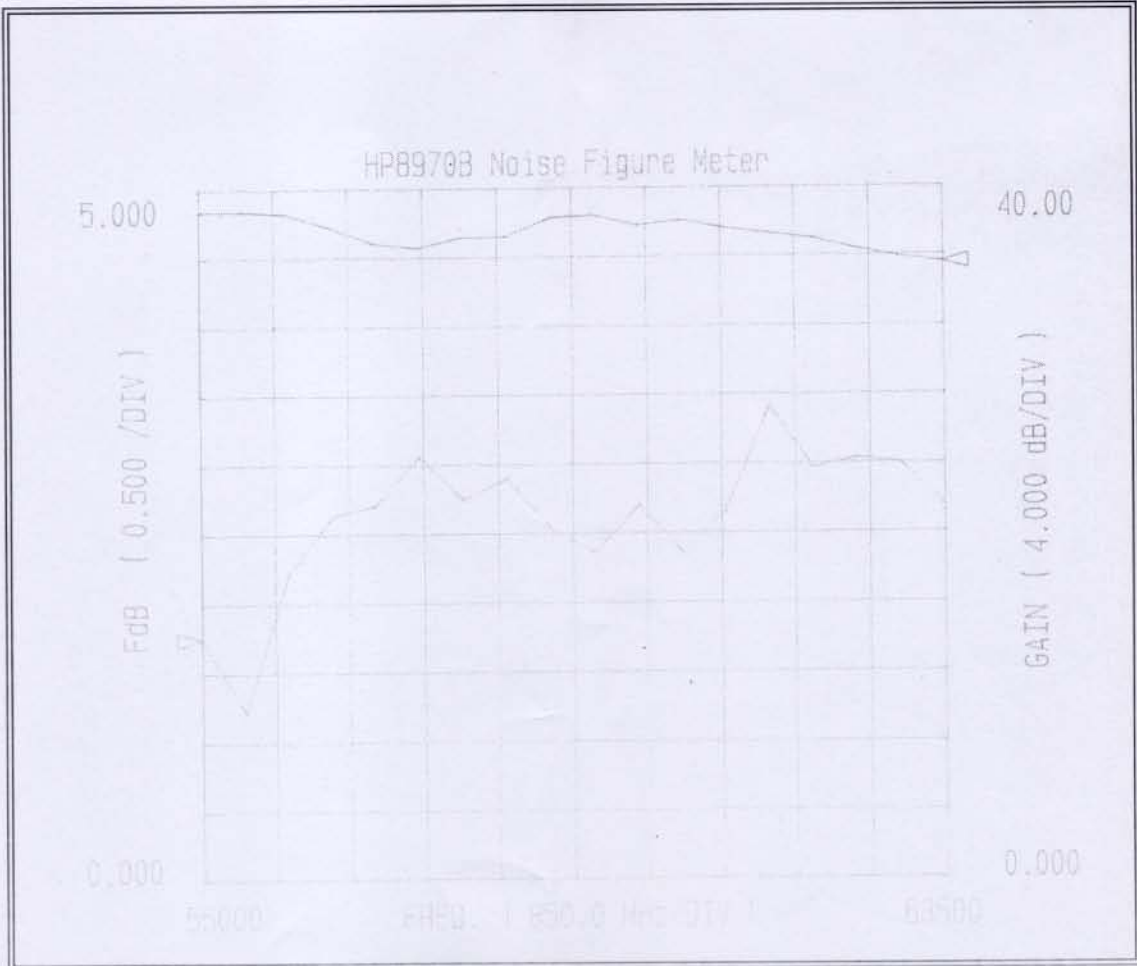
Figure 4. Noise Figure