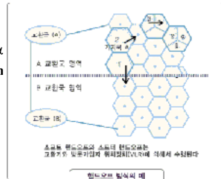
<figure 1> example of hand off

: When client moves to section \gamma from section \alpha of equal base station transceiver system in conservation by phone. use in CDMA mode.